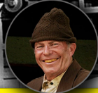
ONE EYE'D JACK