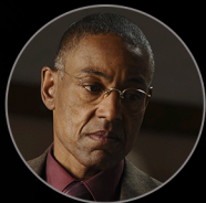
PROF. EFREM GREEN

An expert in paranormal studies, Professor Green's knowledge of spirits is paramount to the group's survival. His history with Jack and Victoria creates tension as the trio become unlikely allies.